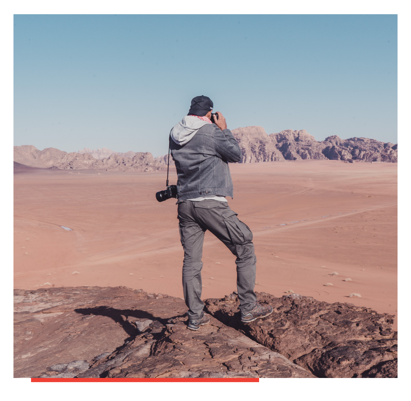
I want to share the authentic stories of the people I meet and the places I visit.